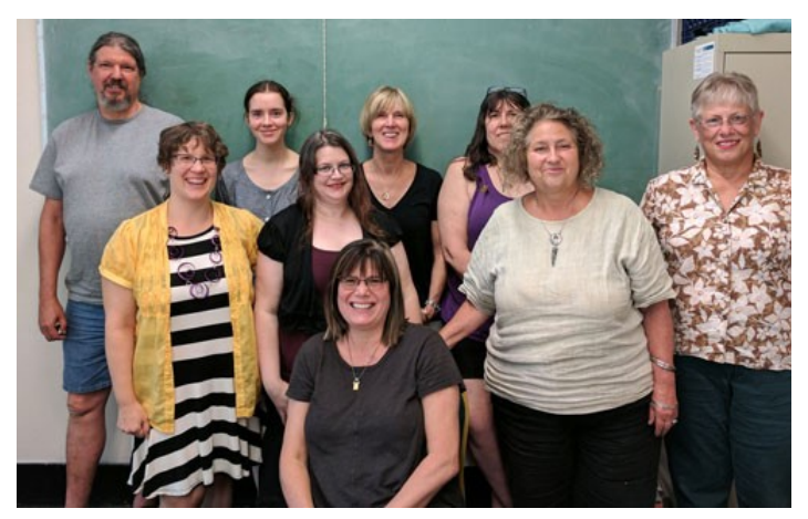
CMAG Board and Committee Chairs

Board meetings are generally held prior to the General Meeting at 6:00 pm in Room 30 at the MAC (same room as the regular meeting). Members are encouraged to attend and contribute.