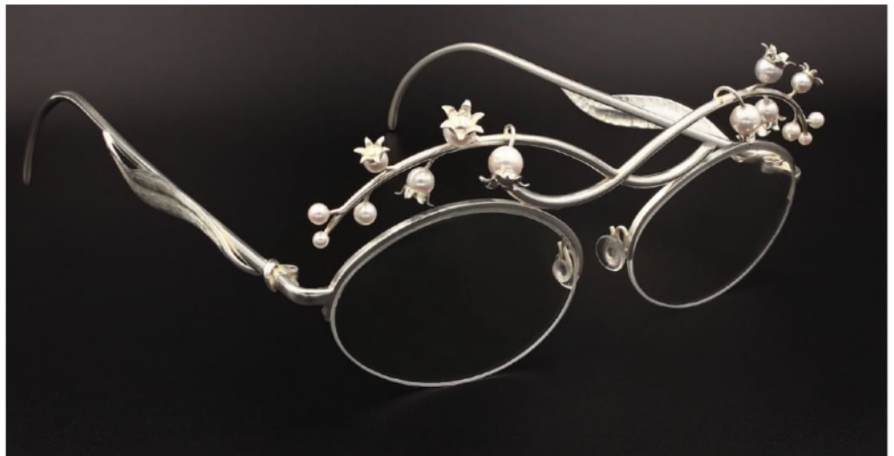
Pearl and Continuum silver eye glasses